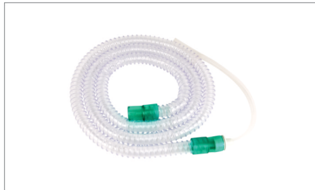
medical smoke evacuation tubing