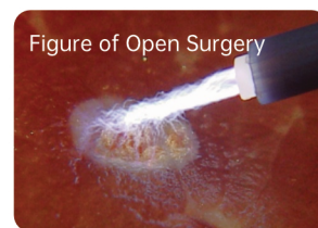
Figure of Open Surgery

Argon gas technology can deliver a longer argon ion beam, ensuring safer tissue ablation, preventing perforations, and providing a clearer field of view during endoscopy.