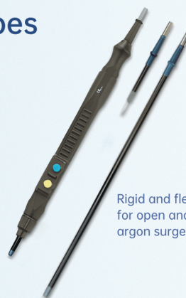
Rigid and flexible probes for open and endoscopic argon surgery